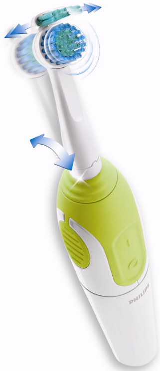
Philips Rechargeable Toothbrush