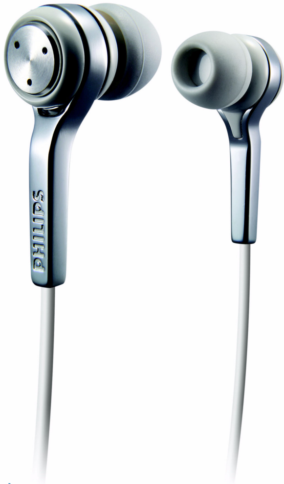
Philips In-Ear Neckstrap Headphones