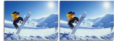
2ms GtG response time > 2ms GtG response time

SmartResponse is an exclusive Philips overdrive technology that when turned on, automatically adjusts response times to specific application requirements like gaming and films, which require faster response times in order to produce judder, time-lag and ghost image free images